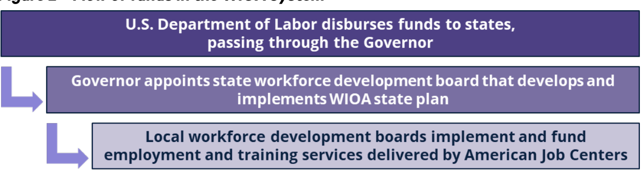
Figure 1 - Flow of funds in the WIOA system

The responsibility and flexibility Governors have to set the vision and guide the coordination of these investments provides tremendous means for Governors to establish and sustain a workforce development system that generates better outcomes for workers, employers, and their communities.